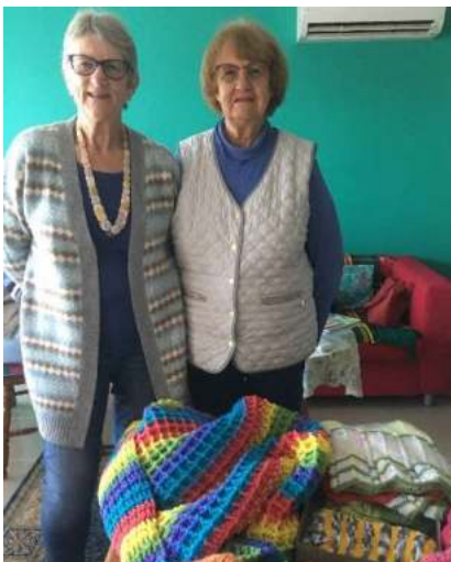
Our intrepid leaders with a few of our projects