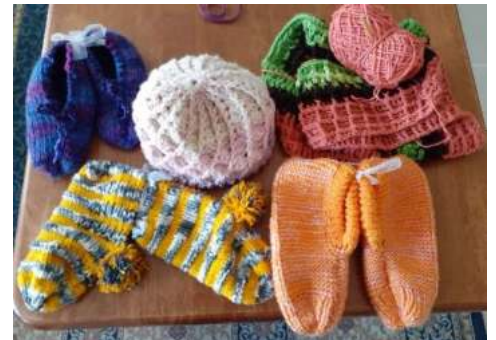
More of our efforts