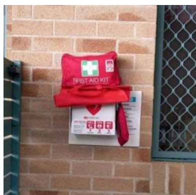
AED location – on the wall behind fence at Gunny's place